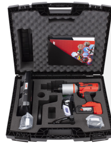
180541 EBT 2,700 N-m Kit